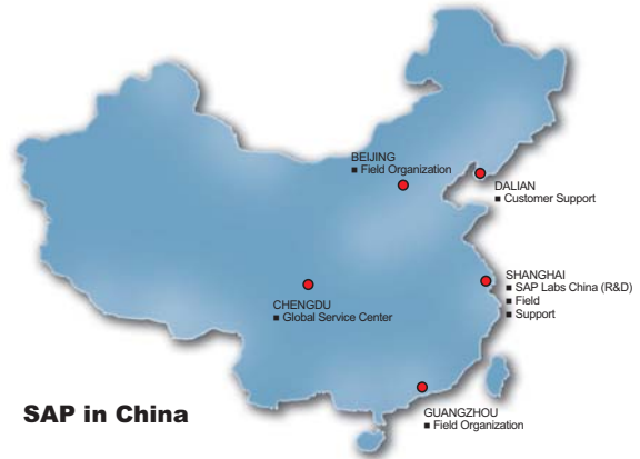
SAP in China

As a strategic R&D center, SAP Labs China has become one of the fastest growing subsidiaries of SAP. Within 2004 alone, employee growth rate doubled. By October 2005, SAP Labs China became the fifth SAP R&D center with over 500 employee. With the on-going construction of the new campus located in Shanghai Pudong Software Park and the launch of SAP Global Service Center Chengdu, SAP Labs China will further strengthen its commitment to the regional and local market, while maintaining a high-speed growth rate. It also plans to increase the employee staff to 1500 by 2008 and sustain its position as a world-class R&D center.